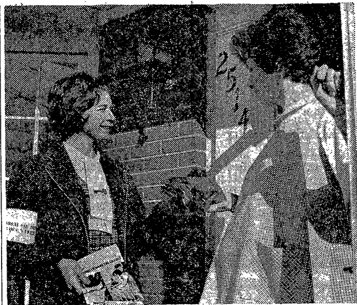
ON THE MARCH to eliminate the threat of rubella (German measles) to unborn children are thousands of Mothers' March volunteers. The March of Dimes works closely with local health departments, medical societies and school officials in organizing rubella vaccination drives throughout communities.

Since the rubella vaccine was licensed by the federal government more than a year ago, March of Dimes chapters around the country have helped mount community drives for mass immunization. During this time, chapter spokesmen, volunteers and members of their medical advisory committees have worked closely with local health departments, medical societies and school officials in programs aimed at eliminating spread of the dreaded rubella. These community efforts have had effective results in many states, including Maryland,